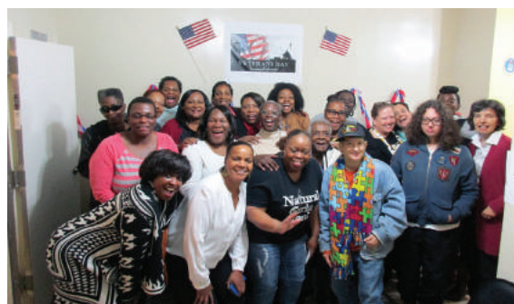
Recent Veterans Day Gathering